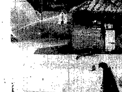
Fire last Wednesday afternoon destroyed the Wayne Sale barn, with an estimated loss of $7,000, including three hogs and a steer.